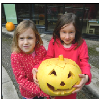
Children with a carved pumpkin grown at their school gardening club in 2012

We have a number of events taking place this autumn, the first of which will be a stall at the Stroud Festival of Nature on 7th September, so please come along and have a go at some of our family activities. We are also running two harvest celebrations. On 14 September we will be holding a stall at the Shambles Market, Stroud, where school gardening clubs will hopefully contribute some of their produce and the children come along to try their hands at being a market trader for the day. Then we will be holding a Pumpkin & Apples event at the Museum in the Park on 27 October where we will have a day of apple pressing finishing off with a carved pumpkin lantern trail, hopefully including some home grown pumpkins. So if you are currently growing pumpkins make sure you save one to carve for the Trail. There will be prizes for the best carved pumpkins in four categories; home grown, primary aged entrants, secondary aged entrants & family entrants.