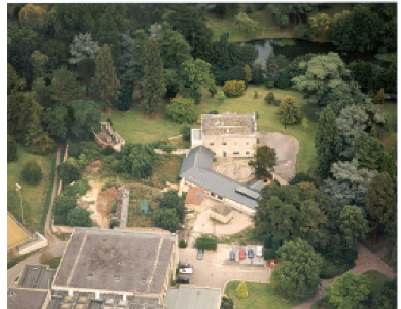
An aerial shot of Museum, the walled garden is the square area on left hand side

Stroud's Museum in the Park has been awarded a grant of just over £50,000 by Arts Council England for a community project to clear the ground in its derelict walled garden in advance of its forthcoming regeneration.