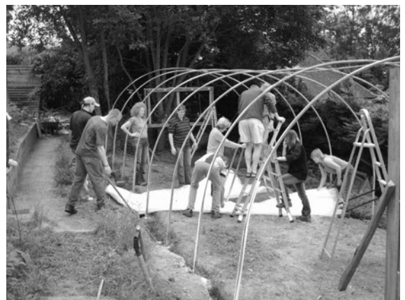
Trainees at Inishfree erecting a new polytunnel