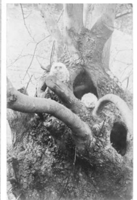
The postcard, with its picture of baby owls in a tree.